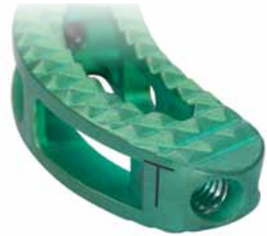
15° offset denoted by a "T" on the right side anterior portion of the implant